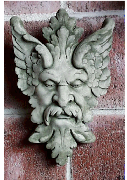
This Green Man is thought to have been sketched by Michaelangelo for a church in Italy

Green Men are common in gothic European churches and Celtic art probably originated with the Celts to be adopted by Christianity and spread throughout Europe and elsewhere. Without any firm evidence it is left to the individual to ponder the exact origin which only adds to the air of mystery surrounding him. Some believe him as Pagan, while others proclaim him a symbol of Christianity. In some churches he is prominently displayed for all to see, giving credence to those who say he was sanctioned by the church.