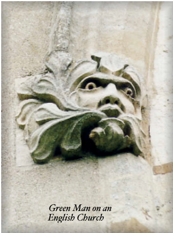
Green Man on an English Church

Enchanting and mysterious, the green man symbolizes the interconnected relationship we share with nature.